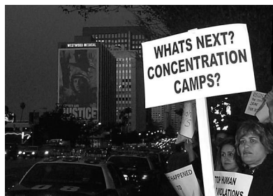
Actual placard from an anti-NWO rally

Even more disturbing (see the above link at time index 2:49), Rahm Emanuel slips in a veiled threat that if you don’t agree to “go to the barracks”, you will “take a train ride”, which refers to being transported to a detention camp.