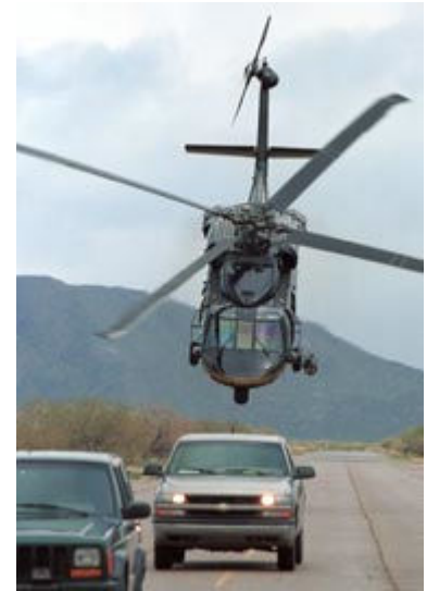
Ever get the feeling you're being followed?